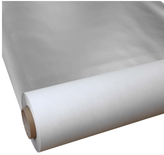
YSHIELD® SAFEBUILD® A190